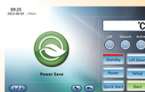
Power Save Mode